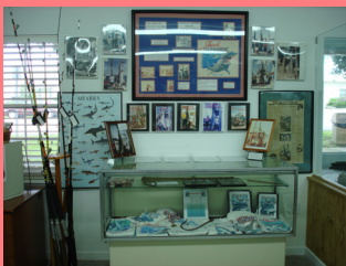
Museum Shark Exhibit highlights tournaments and catches!