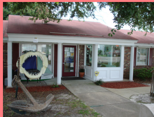
AJ's Restaurant loaned a huge shark jaws for a great "photo op"!