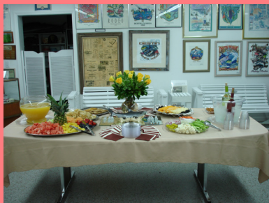
July 15 Hammerhead Exhibit Grand Opening Celebration !